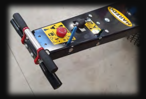
Easy accessible controls