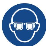
Tightly sealed goggles